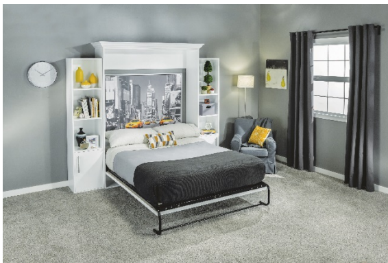
Fold down Murphy Bed