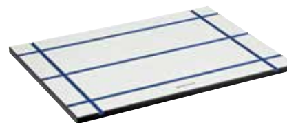
T-Track Table Top 46654 28"W x 40"L x 1 1/8"T