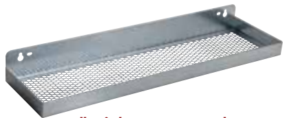
1" High Dust-Free Shop Tray 43488 5"W x 18"L x 1"H 45605 5"W x 24"L x 1"H

Predrilled to mount to our 18" or 24" deep Shop Stands.