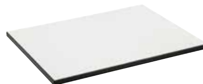
Melamine/MDF Table Top 43872 24"W x 32"L x 1 1/8"T 45996 28"W x 40"L x 1 1/8"T

From melamine-coated MDF to hardwood maple and Rockler's versatile T-Track Table Top, we've got work surface options.