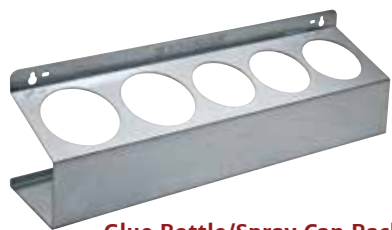
Glue Bottle/Spray Can Rack 43527 4 1/2"W x 18"L x 4"H