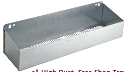
3" High Dust-Free Shop Tray 43500 5"W x 18"L x 3"H 48477 5"W x 24"L x 3"H