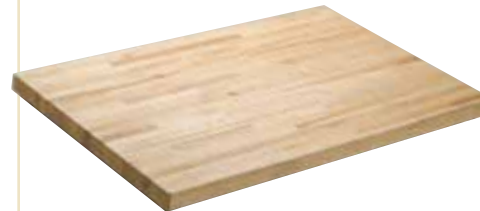
Maple Table Top 29865 26"W x 38"L x 1 3/4"T 25541 26"W x 50"L x 1 3/4"T