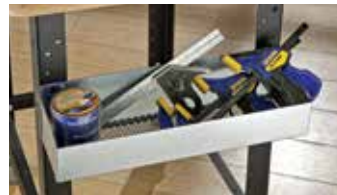
43500 Dust-Free Shop Tray 5"W x 18"L x 3"H