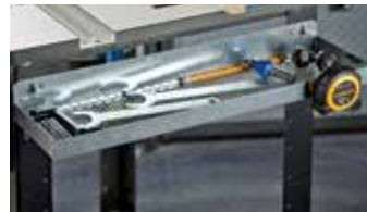
43488 Dust-Free Shop Tray 5"W x 18"L x 1"H