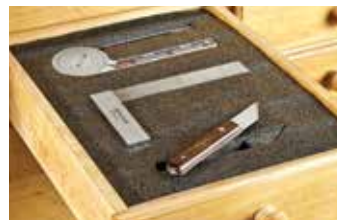
FastCap Kaizen Tool Storage Foam, 2' x 4' sheet 43845 1/8" Thick 46430 2/4" Thick